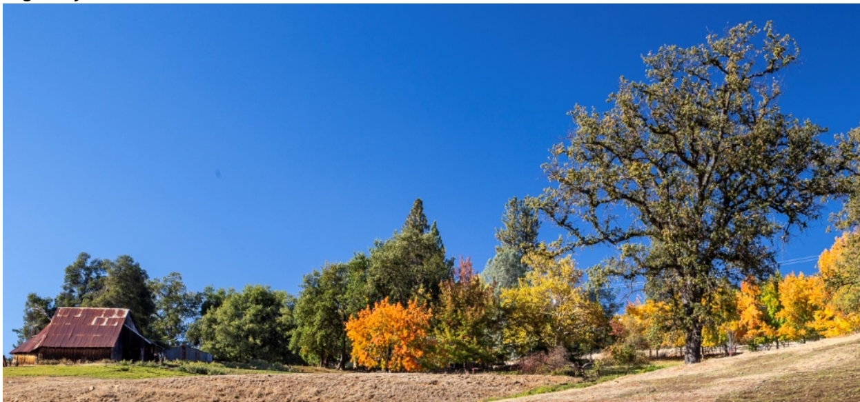
Highway 49 in October